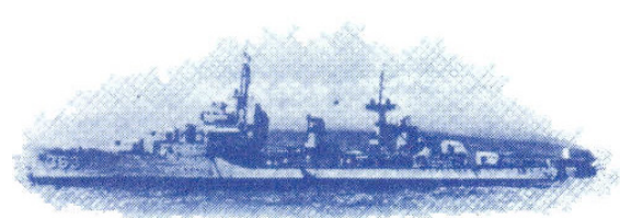
U.S.S. BALCH DD363